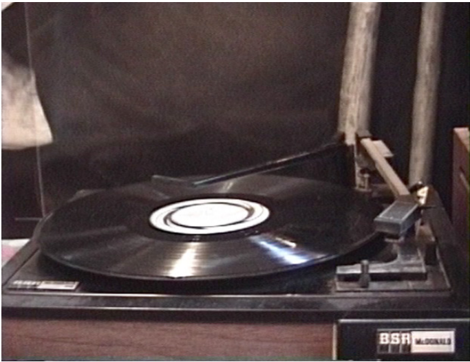
Snap 'n' Snatch, 1990