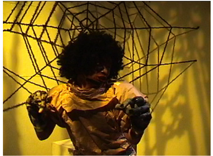
Kaponga Island, 2004

Kuchar's regard of kitsch is ambivalent and double-edged. He subverts it and affirms it. It is negative and positive. On one hand, he uses the emptiness at the heart of kitsch as a metaphor for, and mirror of, emptiness in our souls. On the other hand, his framing of kitsch as anti-art opens a space for expression that can be more authentic to the extent that it is unrestricted by "good taste." In both cases, Kuchar's use of kitsch as a narrative device is a function of irony. He subverts kitsch by embedding it in shit, by framing it in ironic relation to that which it denies, the dark side, mostly scatological. This is not parody. Kuchar tells us "read this as kitsch," but within his bleak metanarrative kitsch becomes automatically tragic: its empty sentimentality can't nourish the soul, its inflated cheerfulness can't hide a desperate existential crisis, its lurid eroticism is an unattainable ideal, its false nutrition gnaws at a stomach forever hungry.