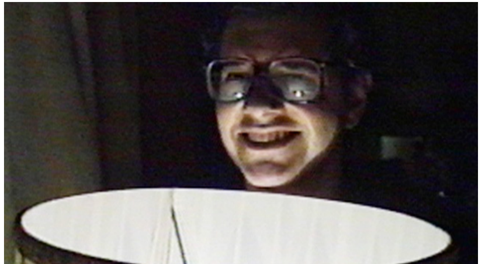
Cult of the Cubicles , 1987

never that of others. He reaches out, but he doesn't really want to fully engage the world. His subjective enclosure is isolating, but it is also protective, so he retreats into it and he takes us with him.