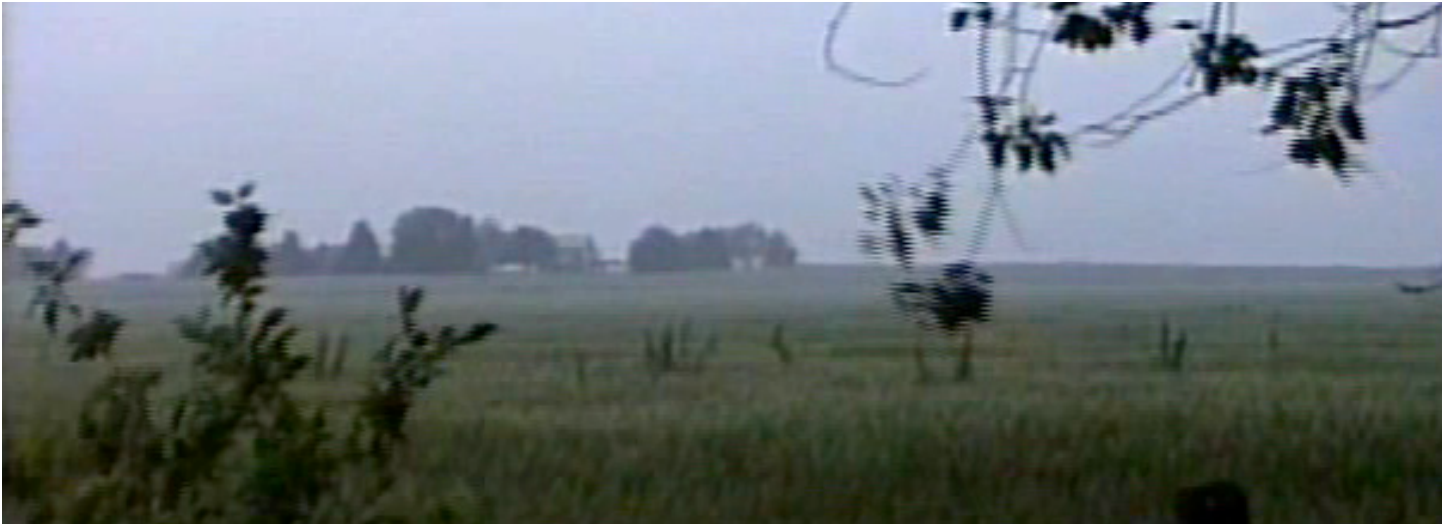
Weather Diary 6, 1990

run throughout the diaries. I discuss the most important ones in this essay and cite some examples.