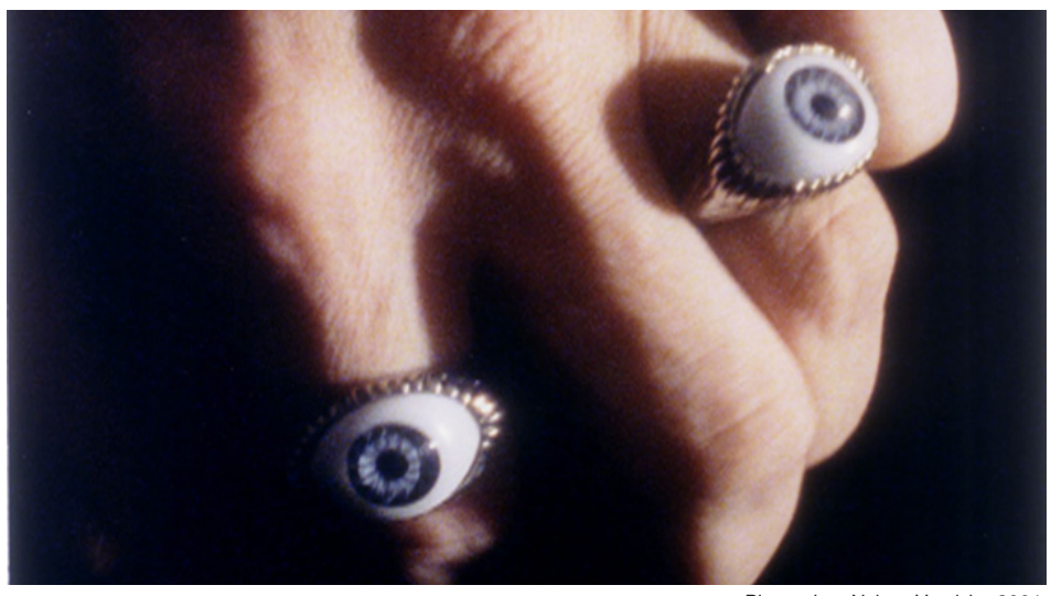
Planetarium, Nelson Henricks, 2001

anxiety of influence concern you (all texts are created out of existing texts, and "break throughs" occur within a generational tension between canonized forbears and the present), or has all that been left behind?